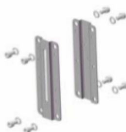
Steel Support w/ Bolting